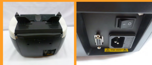
Easy updates with PC cable connection

CR2 works with USD, Canadian Dollar, Euro, and many other currencies (optional). CR2 Cash Counter has successfully passed testing at several major US and international banks. The machine comes with complimentary 1 year warranty (2 years in certain markets).